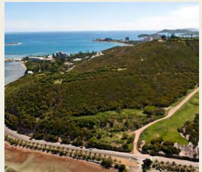
↓ Ouen Toro, Nouméa (South)