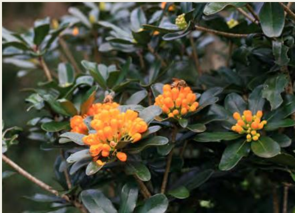
Saved from extinction but still critically endangered: Pittosporum tanianum

However, in 2002 two individuals of the plant were rediscovered by a botanist from the Southern Province's Direction of Natural Resources, then a third tree. In order not to take the risk of losing the species once again, cuttings were taken for its reproduction ex situ . It took a few trials before scientists were able to master the plant's reproduction, but by 2004 a technical guide was designed to ensure that the plant could be reproduced in nurseries. This plant is symbolic of the precarity of the dry forest. Although removed from the list of extinct species, it remains classified as critically endangered on the IUCN Red List and the necessary measures to secure its survival in the wild on the isle of Leprédour - including managing the populations of grazing deer, rabbits and rats - have not been effective. Although hundreds or even thousands of plants of the species have been produced and replanted in the Parc zoologique & forestier and in private gardens, the species remains at risk of extinction on its original site.